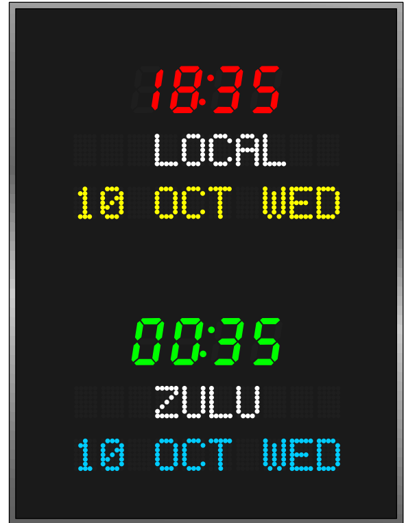
Model 3073A- 1.8" time, 1.2" zone labels, 1.2" date, 2 zones